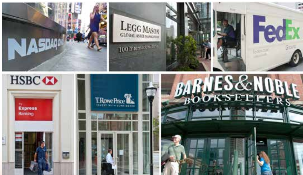
Grayloc Partners Patuxent Capital Consulting

Many of your stories will come out of meetings. But instead of reporting on the meeting, report on the key outcomes from the meeting. The results.